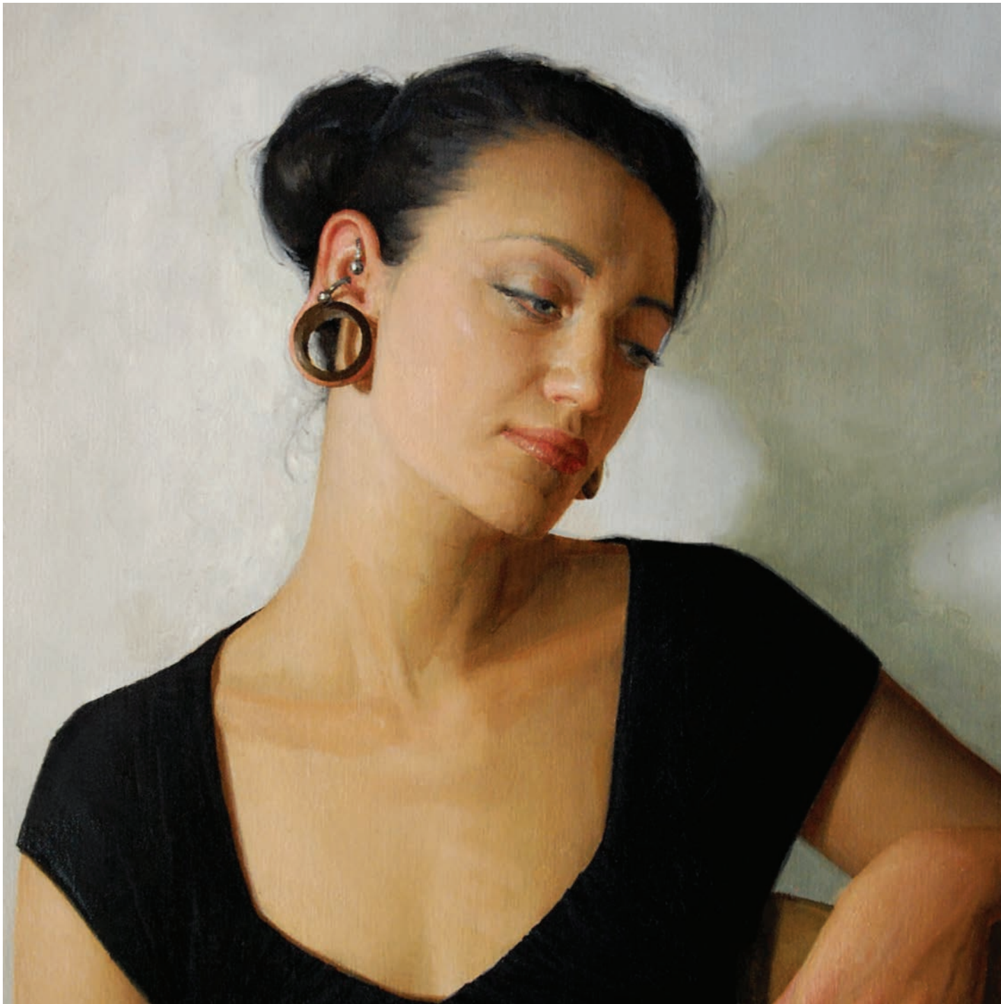
Marina, 15" x 21"