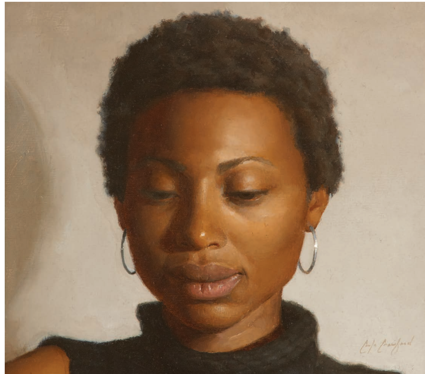
Sesame, 10" x 10"

my models. I find I am always trying to observe and see more of the person, to capture physical likeness, personality, and emotion. I aspire to portray my subjects as faithfully as I can without idealization. It is the details of people that interest me and keep me engrossed in my work. Searching out what makes one face or figure particular and different from another is something I find endlessly intriguing and worthy of continued study. While I work in a classical manner I am most interested in painting the people I see and interact with in my daily life. It is my hope that my work captures this mix of both the traditional and contemporary.