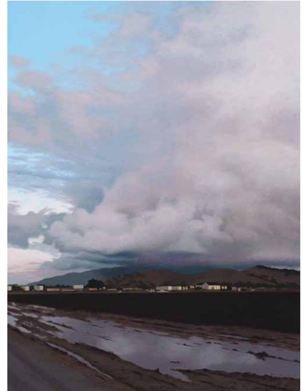
Silver Light Acrylic on Canvas, 24 x 18

All of the quotes in this publication are from East of Eden by John Steinbeck