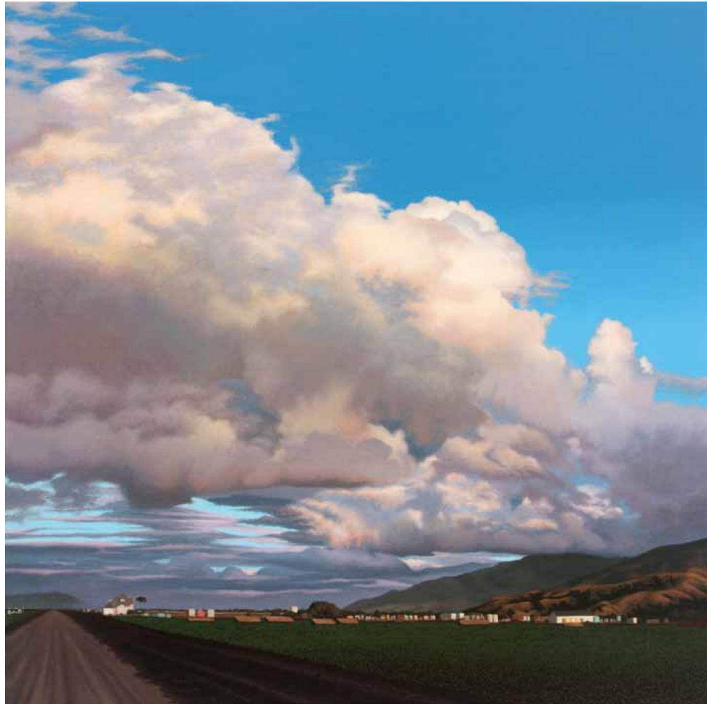
Untitled Acrylic on Canvas, 36 x 36 Private Collection of Nancy and Bill Campbell