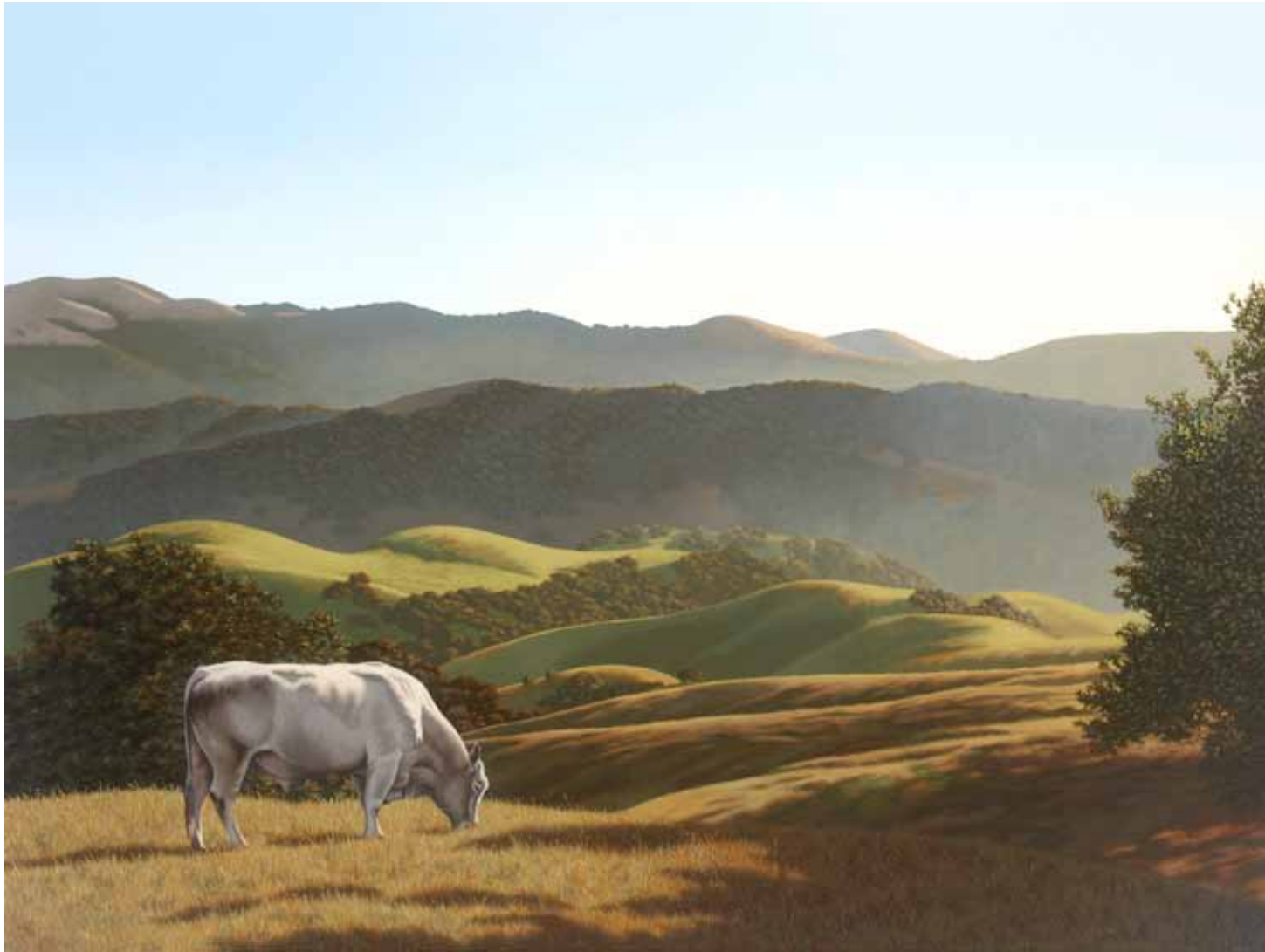
Untitled Acrylic on Canvas, 48 x 36 Courtesy of Winfield Gallery

“THE GREEN LASTED ON THE HILLS FAR INTO JUNE BEFORE THE GRASS TURNED YELLOW. THE HEADS OF THE OATS WERE SO HEAVY WITH SEED THAT THEY HUNG OVER ON THEIR STALKS. THE LITTLE SPRINGS TRICKLED ON LATE IN THE SUMMER. THE RANGE CATTLE STAGGERED UNDER THEIR FAT AND THEIR HIDES SHONE WITH HEALTH. IT WAS A YEAR WHEN THE PEOPLE OF THE SALINAS VALLEY FORGOT THE DRY YEARS.”