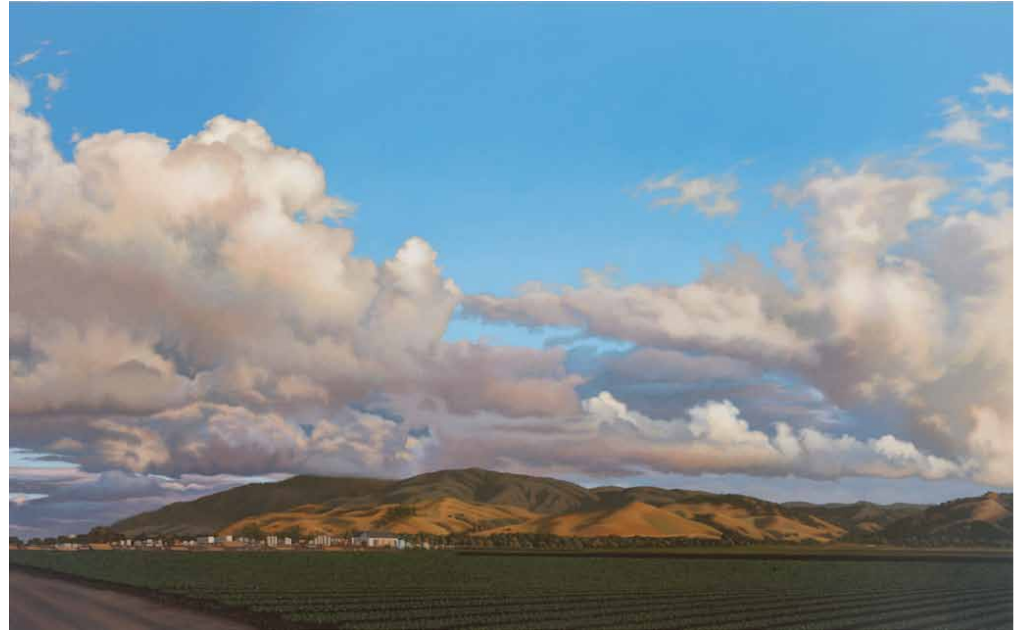
Landscape with Field Rows Acrylic on Canvas, 30 x 48