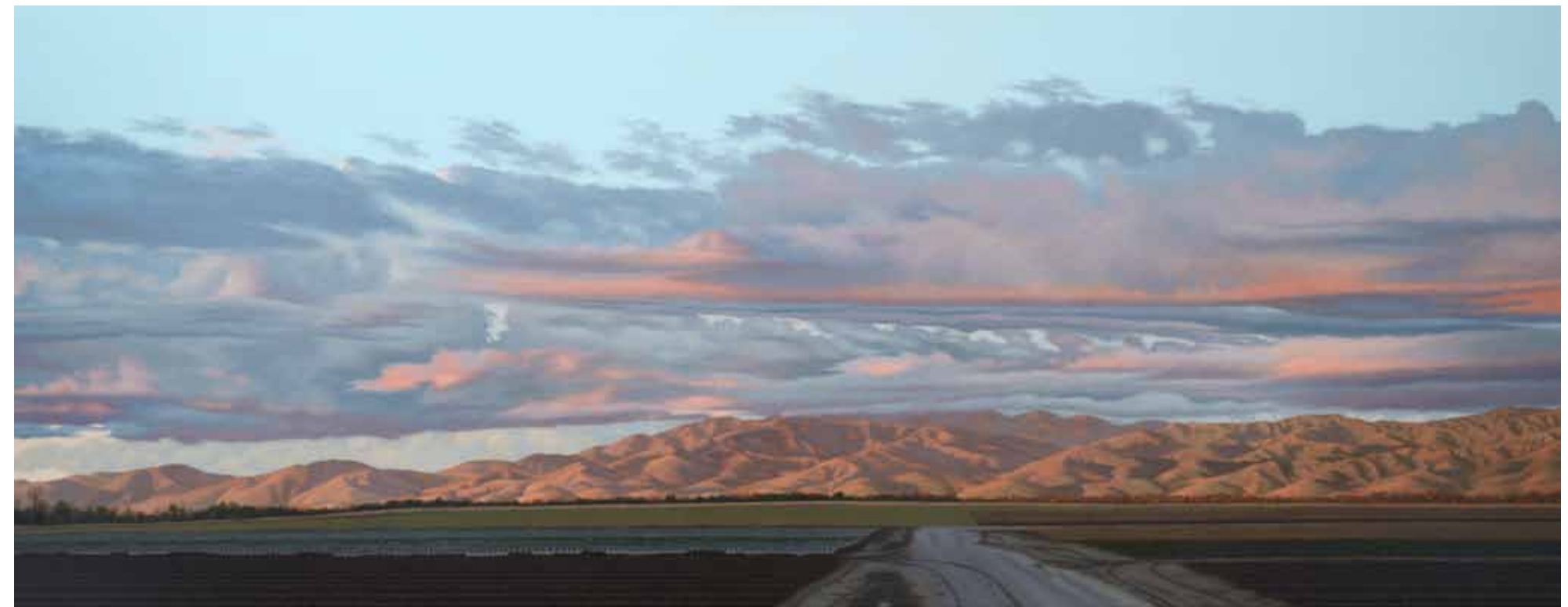
Gabilan Mountains Acrylic on Canvas, 28 x 72 Courtesy of Winfield Gallery