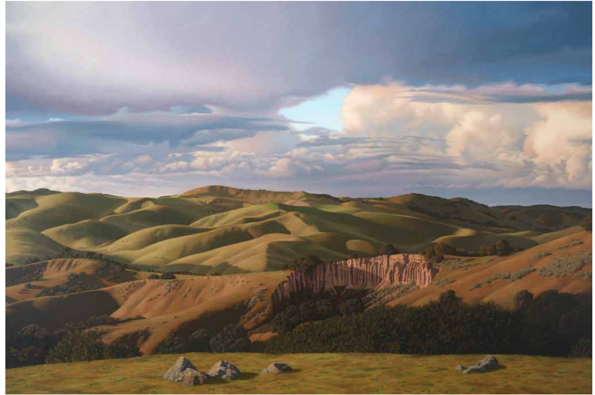
View Over Fort Ord Hills Acrylic on Canvas, 48 x 72 Courtesy of Winfield Gallery