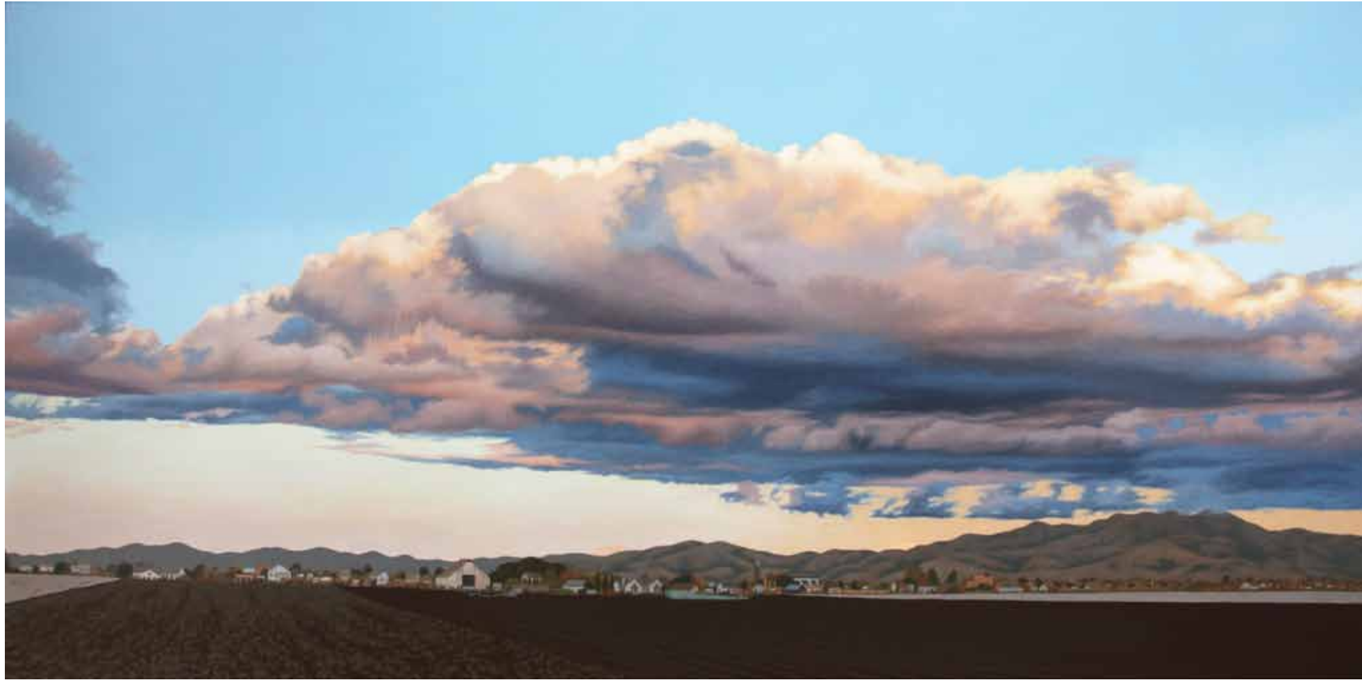
Valley Floor Acrylic on Canvas, 36 x 72

“NOW, ON THE TOP IS GOOD SOIL, PARTICULARLY ON THE FLATS. IN THE UPPER VALLEY IT IS LIGHT AND SANDY, BUT MIXED IN WITH THAT, THE TOP SWEETNESS OF THE HILLS THAT WASHED DOWN ON IT IN THE WINTERS. AS YOU GO NORTH THE VALLEY WIDENS OUT, AND THE SOIL GETS BLACKER AND HEAVIER AND PERHAPS RICHER.”