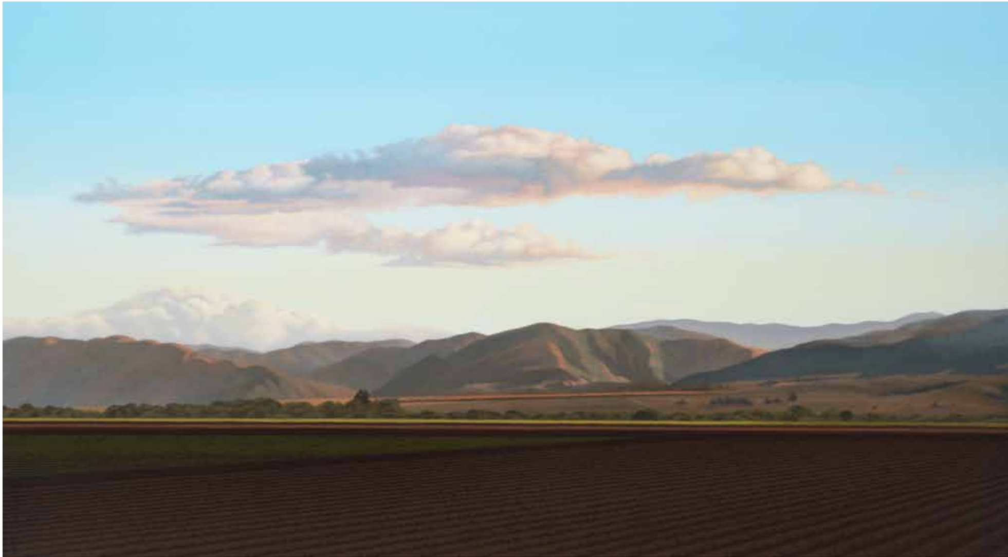
Outside Greenfield Acrylic on Canvas, 24 x 36

“THE FLOOR OF THE SALINAS VALLEY, BETWEEN THE RANGES AND BELOW THE FOOTHILLS, IS LEVEL BECAUSE THIS VALLEY USED TO BE THE BOTTOM OF A HUNDRED-MILE INLET FROM THE SEA...ON THE WIDE LEVEL ACRES OF THE VALLEY THE TOPSOIL LAY DEEP AND FERTILE.”