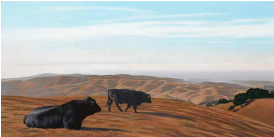
Black Bulls On Olassen Peak Acrylic on Board, 12 x 24 Courtesy of the Artist

“WHEN JUNE CAME THE GRASSES HEADED OUT AND TURNED BROWN, AND THE HILLS TURNED A BROWN WHICH WAS NOT BROWN BUT A GOLD AND SAFFRON RED — AN INDESCRIBABLE COLOR.”